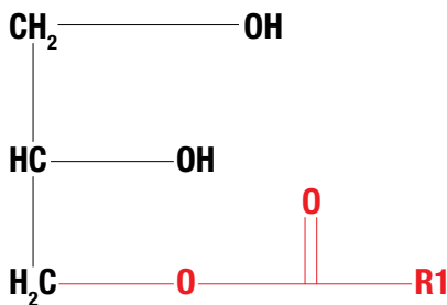
Figure 1. Monoglyceride Chemical Representation in MaxSimil Fish Oils (R1 = fatty acid)

Unique structure: One fatty acid attached to a glycerol backbone provides two polar ends that attract water and a non-polar tail end (R1) that attracts fat, thus enabling self-emulsification of the Omega 3's formulas.